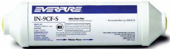
IN-9 CF-S: EV9100-75

Designed for great taste and odor reduction